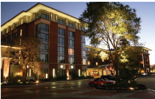
Figure 2. Lighting reinforces building's identity and enhances architectural features.